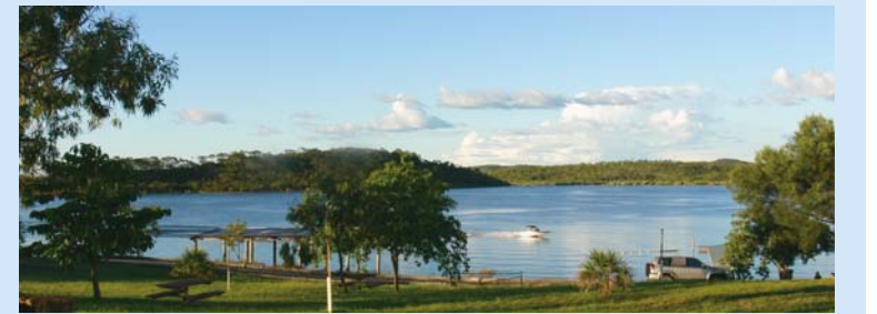
Lake Belmore is less than 4km from town.