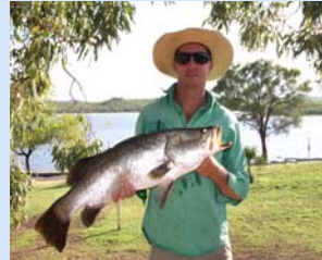
Catch a Barramundi