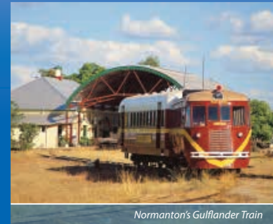
Normanton's Gulflander Train

Explore the 4WD tracks of Gregory National Park and watch the sun set over Keep River National Park's sandstone ranges. Katherine is a great base for adventures including Nitmiluk National Park's 13 gorges with spectacular walks, cruises and canoeing. World Heritage Listed Kakadu National Park features rock art galleries over 20,000 years old and a myriad of wildlife. Swimming in Eley National Park is invigorating, and the mysterious Lost City can be accessed from Cape Crawford. Visit cattle stations that are opening for visitors along the Borroloola route, and be sure to pack your fishing rod for King Ash Bay and the mighty rivers of the Northern Territory.