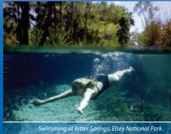
Swimming at Bitter Springs, Eley National Park

The turquoise waters, red sandstone cliffs, cosmopolitan cafes and endless expanse of Cable Beach make Broome the perfect place to start or end a journey. Along the highway route explore eerie Tunnel Creek, cruise on the magnificent Geikie Gorge, discover the history of Halls Creek and take a flight over Purnululu National Park's Bungle Bungle Range. The unsealed Gibb River Road boasts stunning gorges and cattle station experiences. Relax in the agricultural hub of Kununurra and don't miss the expansive Lake Argyle. You'll find a rich indigenous heritage throughout The Kimberley in its rock art, contemporary art galleries and the wide range of tours available.