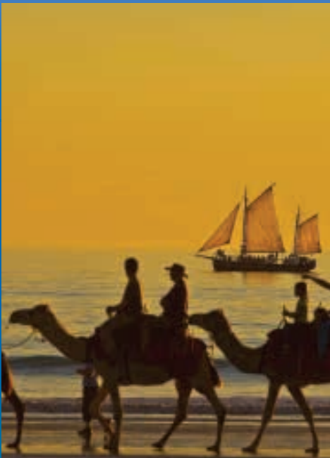
Cable Beach, Broome