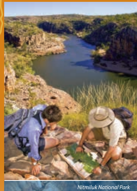
Nitmiluk National Park

Whether you are camping or staying in accommodation, travelling the entire Savannah Way or just tackling one section at a time, there are many experiences to enjoy. Take your fishing gear to try your luck in peaceful dams or creeks, wide rivers or the northern Australian coast. Pick up a bird field guide and binoculars to discover an incredible array of bird life across forever changing natural habitats. Pack a couple of golf clubs to challenge the quirky local courses in main towns. Across the route you'll find many opportunities for inspiring walks, connecting with Australia's indigenous and pioneering past, and of course a social drink with locals and other travellers.